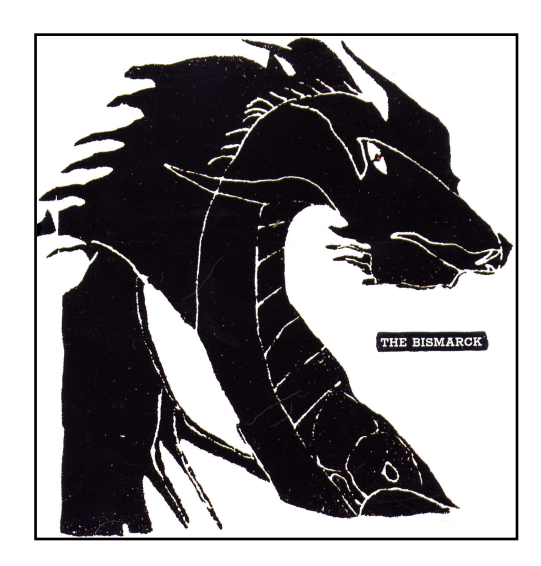
Recommended Tracks: FCC Indecent: